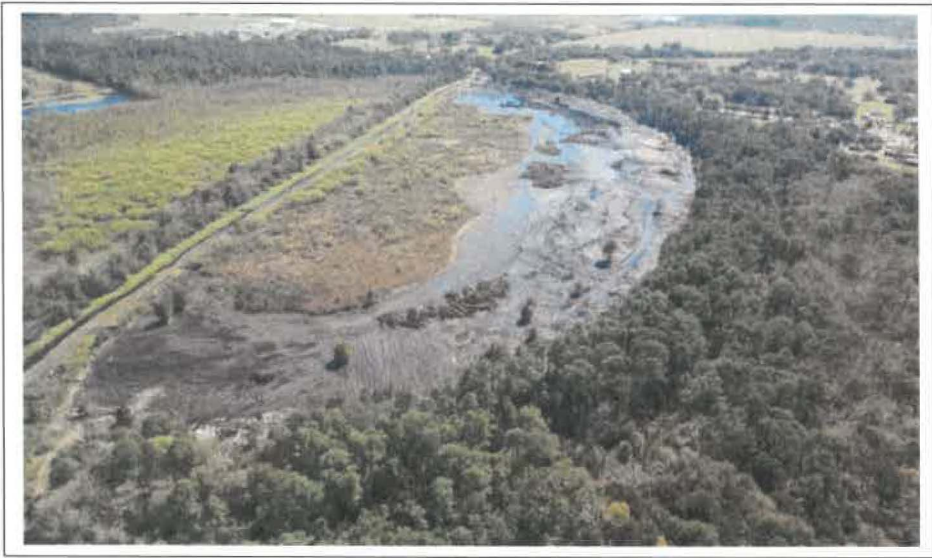
Lake Gwyn West