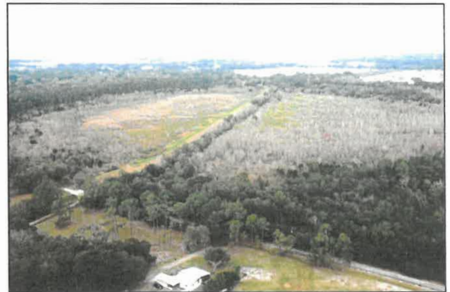
Lake Gwyn Project Area Looking Northwest