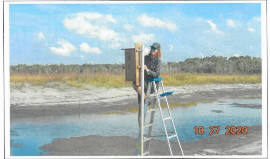
Installing Duck Boxes