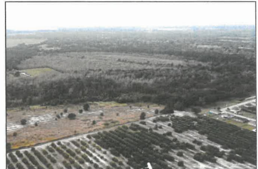
Lake Gwyn Project Area Looking Southwest