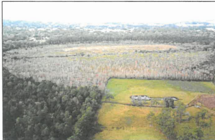
Lake Gwyn Project Area Looking West