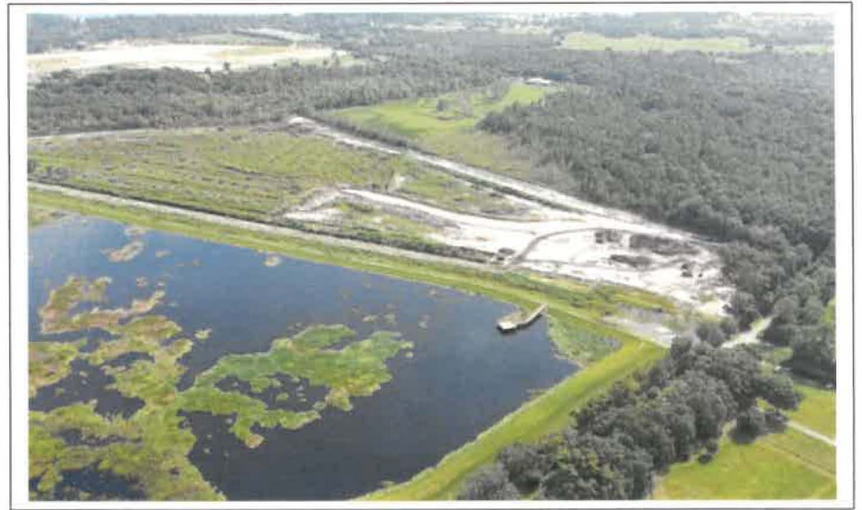
Lake Gwyn East