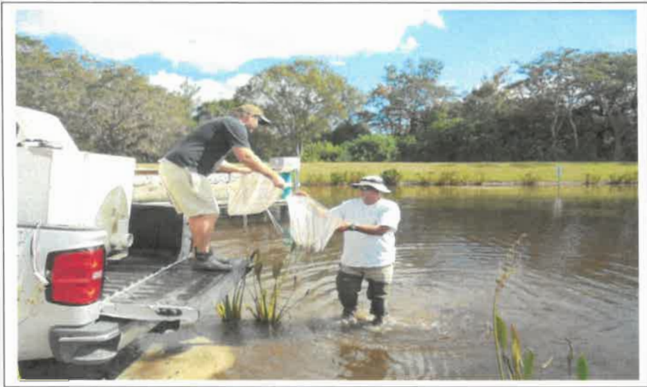
Stocking Large Mouth Bass