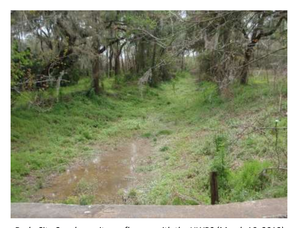
Dade City Canal near its confluence with the UWRS (March 16, 2010)