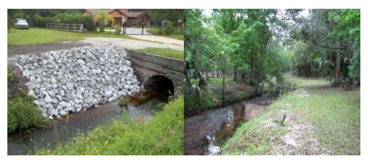
Tomoka Farms Roadside Ditch

There are number of roadside ditches and canals that flow into the B-21 Canal, which is a jurisdictional water located in Volusia County. For example, there are approximately 80,250 ft. of large roadside ditches on Tomoka Farms Road and approximately 31,650 ft. of canals draining into the B-21 Canal. The B-21 drainage basin is approximately 21,400 acres, comprised of approximately 3,000 acres of urban land use, 1,400 acres of agricultural, 10,000 acres of uplands and 9,000 acres of wetlands.