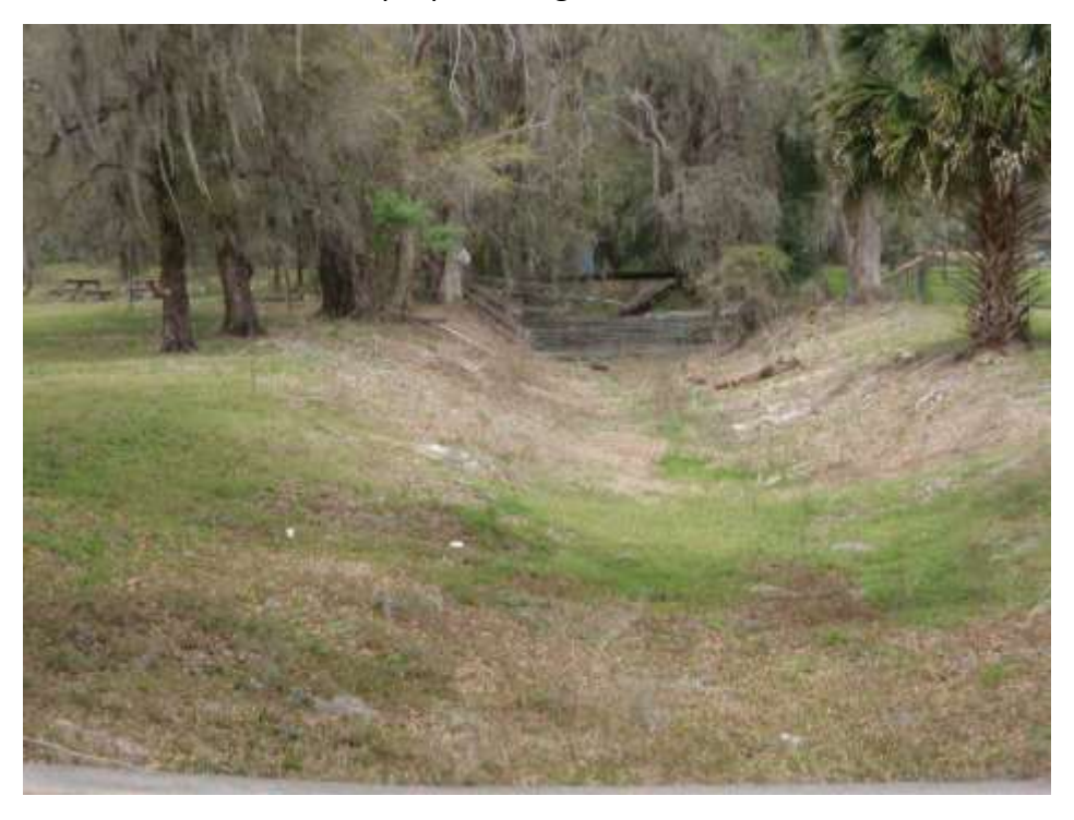
Dade City Canal near its confluence with the UWRS (March 16, 2010)

Dade City Canal is a manmade conveyance located in the Upper Withlacoochee River Watershed. The canal was originally dredged for flood control and drains to the Upper Withlacoochee River Swamp (UWRS) prior to discharging into the Withlacoochee River. The Withlacoochee River is a jurisdictional waterbody or Water of the United States (WOTUS). Prior to 2007, flow in Dade City Canal was dominated by point source discharges from the Dade City WWTP and the Lykes Pasco Beverage facility. Both of these point sources have been removed and the canal is now typically characterized by zero to very low flows even when the Withlacoochee River stage is high. Dade City Canal is not now considered to be WOTUS but would be considered such under the proposed regulations.